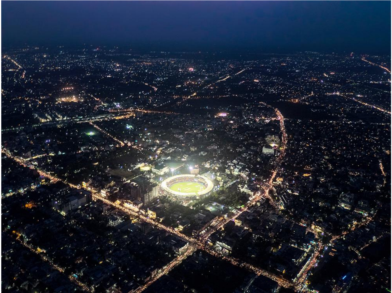
View from the drone at Holkar Stadium, Indore