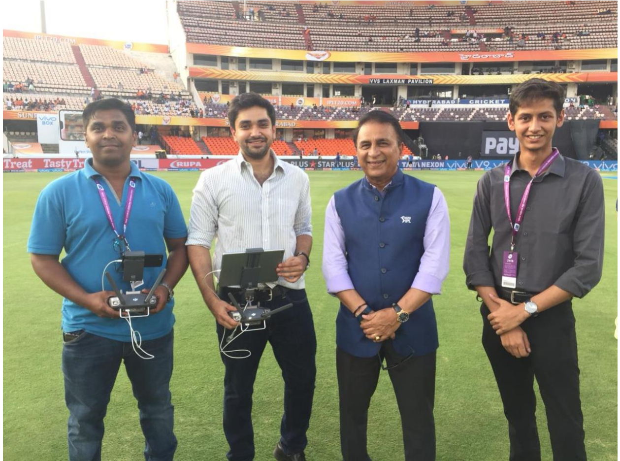
Team Quidich being interviewed on Star Sports by Sunil Gavaskar