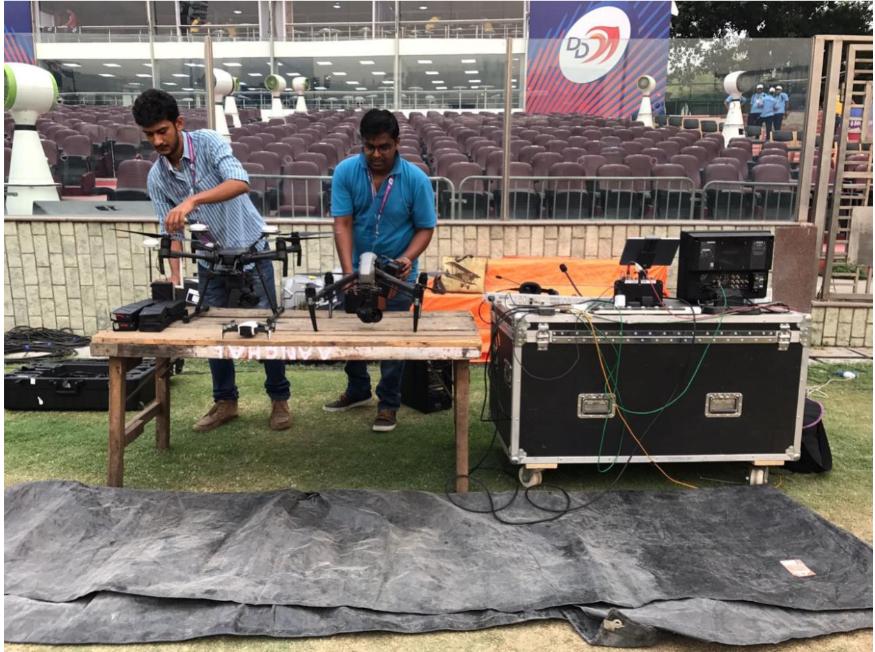
Team Quidich setting up bases at Delhi